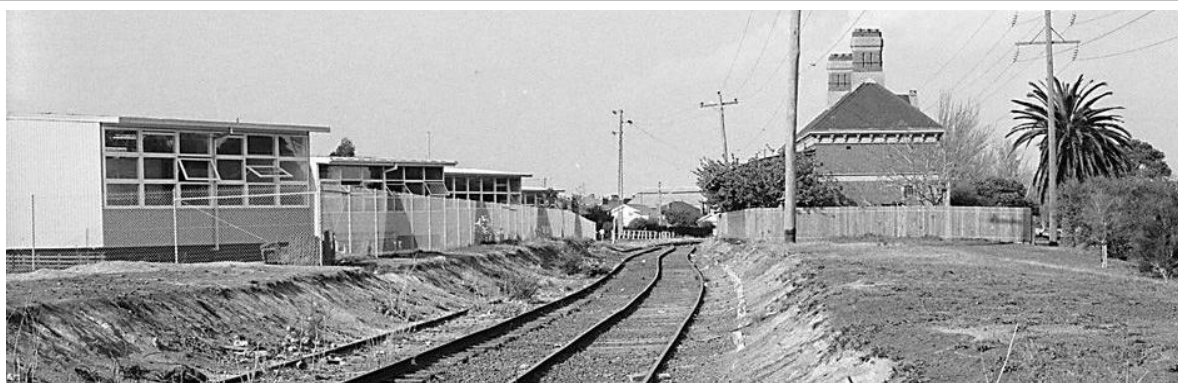
For several years while the Princes Hill High School was being re-built in Arnold Street, Forms 3 and 4 were located in these portable classrooms on disused railway land in Park Street, Princes Hill.

The North Carlton Primary School in Lee Street, North Carlton, was built on the site of a former prison stockade and lunatic asylum. The superintendent's residence was a double-fronted bluestone cottage built near the Canning and Yorke (later Lee) Streets corner. When the cottage was demolished in 1913, the workmen discovered several underground cells, which were thought to house convict servants during the stockade era. That was over 100 years ago, but the rumour persists that there are cells beneath the school principal's office.