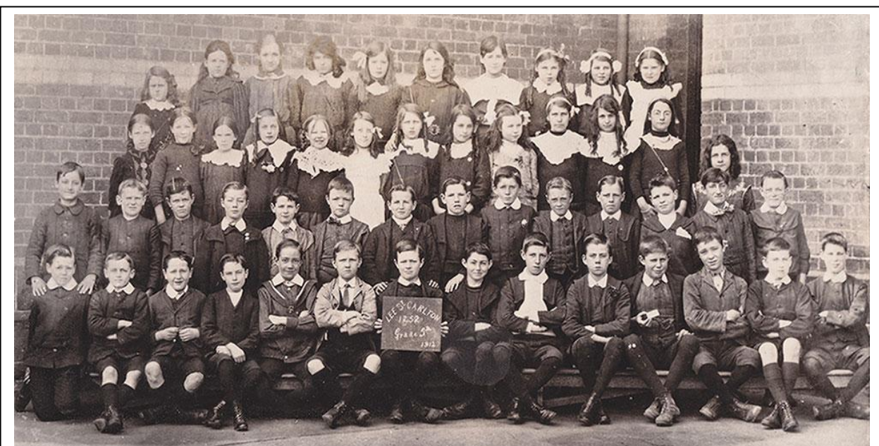
Grade 5 at Lee Street State School in 1912.

The quality of schooling provided in those early days varied considerably. The buildings used were often makeshift, badly ventilated, inadequately heated and sometimes designed for other purposes. Many denominational schools, for example, were also used as churches, and it was not unknown for several classes to be taught in the one large room or hall. Often playgrounds were non-existent, especially in inner suburban areas like Carlton. In the 1860s, there were six officially recognised schools in the Carlton area between Rathdowne and Madeline (now Swanston) Street, and Faraday and Queensberry Street. Some of these were church schools and others National or Common schools. There were also many smaller schools, often run by women in their own homes. (continued page 2)