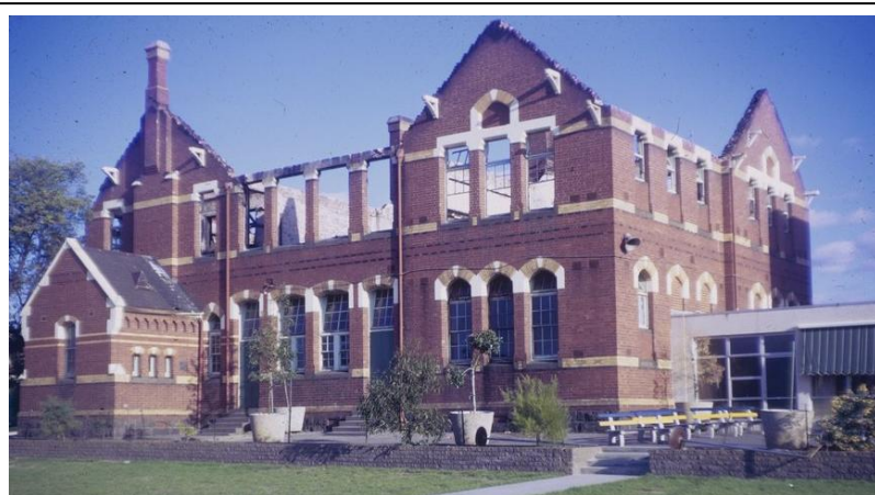
The main building of Princes Hill High School shortly after it was damaged by fire on 8 February 1970

I lived in Arnold Street, half a block from the Princes Hill High School in 1970. It was a hot February night, and the windows were open. We woke in the early morning to a strange echoing click, click sound. From the front garden we could see light in the sky and the old nineteenth century school burning fiercely. The clicking sound was the roof tiles falling into the school ground and onto the footpath. The building could not be saved and had to be demolished. The students continued their education in portable classrooms on nearby railway land until a new architect designed school was built on the site, opening in 1973.