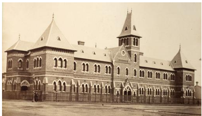
The Faraday Street State School, which is still serving the Carlton community as the Kathleen Syme Library and Community Centre.